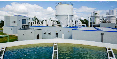
WATER AND WASTE WATER

Our vertical hollow and solid shaft motors are UL certified for NEMA Premium Efficiency and Construction, with models ranging from 7.5 hp to 1000 hp to serve a wide range of industrial and agricultural applications.