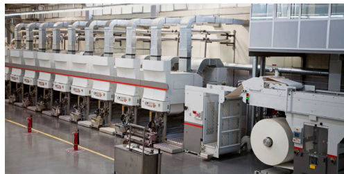
PULP AND PAPER MILLS